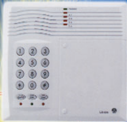
LS400 Control Panel