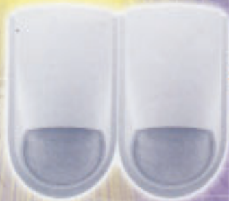
Two-wire PIR TW402