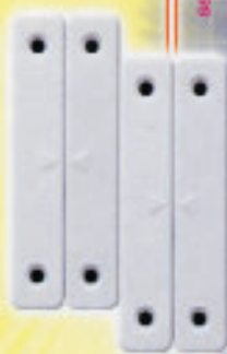
Magnetic Contacts MRS101