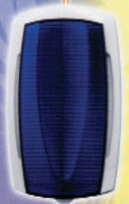
External Siren GOMBELL